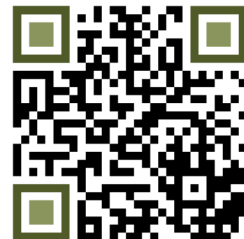
CLPSEF Golf Outing

See payment options at https://www.clps.org/apps/pages/golfouting